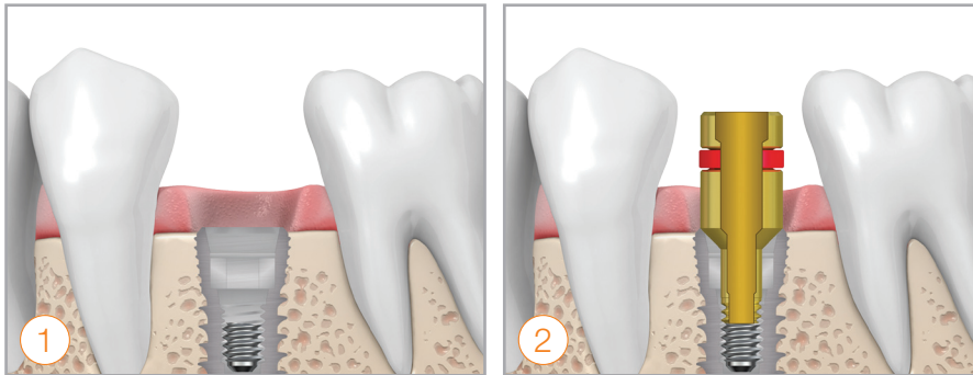
1 Fractured screw